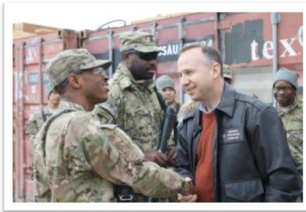
Governor Jack Markell greeting Delaware National Guard troops in Afghanistan during a November visit.

Added Markell: “As Lieutenant Governor Jim Cawley of Pennsylvania has stated, ‘No amount of economic benefit would justify the degradation of our land, air and water.’”